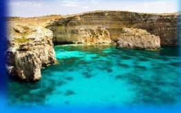
2 - CRYSTAL LAGOON

OPTIONAL: TRANSPORT to & from your accommodation / hotel at €10 per person (Children under 3 free) BOTH WAYS