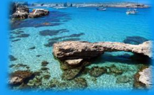
SANTA MARIJA BAY