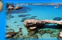
6 - BLUE LAGOON

OPTIONAL: TRANSPORT to & from your accommodation / hotel at €10 per person (Children under 3 free) BOTH WAYS